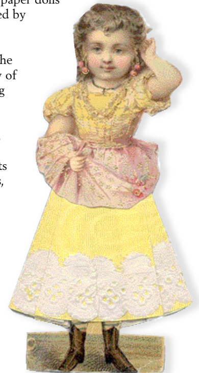
Paper Doll. McLoughlin Bros., New York, ca. 1870s–1880s