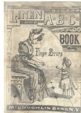
Linen ABC Book: First Steps. McLoughlin Bros. New York, ca. 1890.