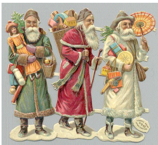
Right: Three Santas Figures (Gigantic Relief No. 842). Raphael Tuck. London, ca. 1880–1909

Winterthur Library is located in the Crowninshield Research Building, accessible from the main entrance to Winterthur, An American Country Estate.