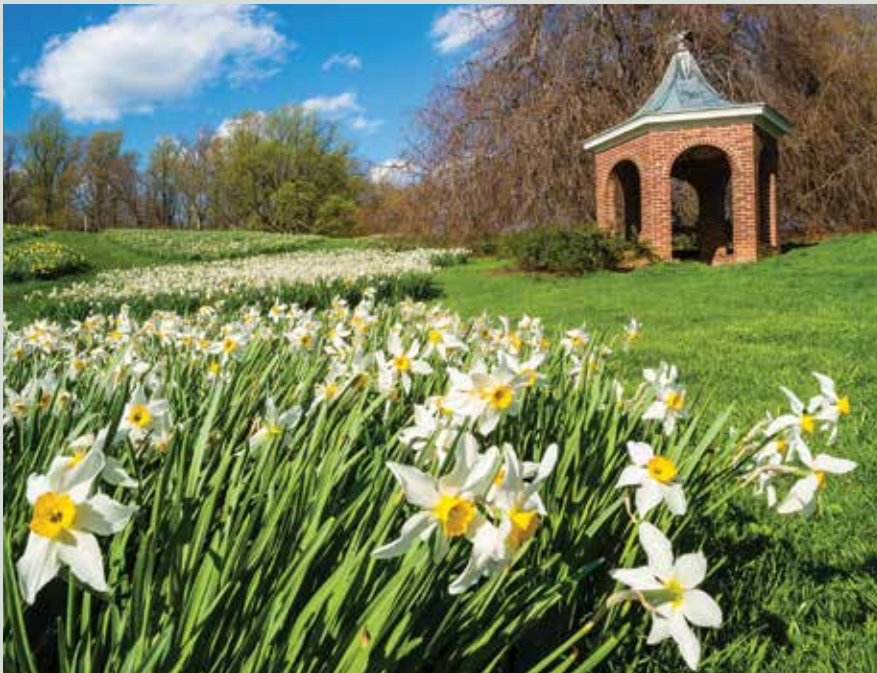
The Brick Lookout folly on Sycamore Hill at Winterthur dates to the 1960s.

landscape, whether you are seeing them as part of a great country place in England or in the historic gardens of Monticello and Mount Vernon. As a gardener, you can put this knowledge of follies to use in your own landscape.”