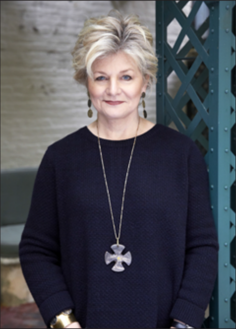
Charlotte Moss

The Chase Center on the Riverfront is at 815 Justison Street. For information or to purchase tickets, das@winterthur.org , www.winterthur.org/das or 800-448-3883.