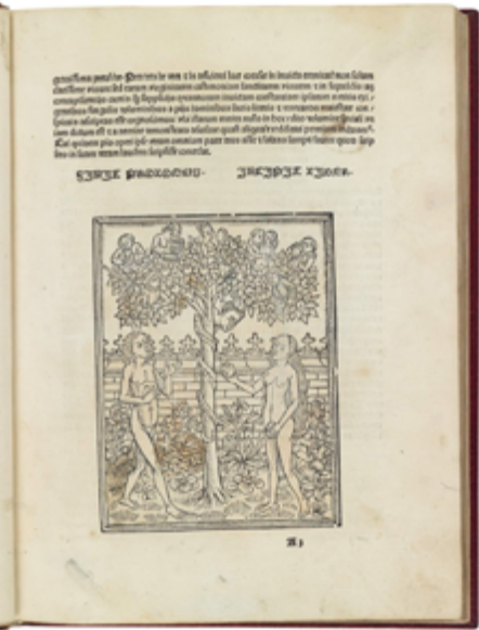
Giovanni Boccaccio, De Claris Mulieribus , Louvain, 1487 ($15/25,000).

Swann Auction Galleries is at 104 East 25th Street. For information, 212-254-4710 or www.swanngalleries.com .